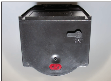
Electronic Hand Sensor At Bottom