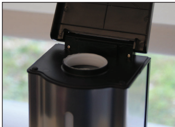
Easy Fill Soap Reservoir