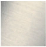
platinum matte 27 522 819-06