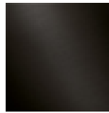
Dark Platinum matte 27 522 819-99

More custom finish options are available via special production (xTra Service). Please see our finish matrix for availability and pricing or contact a Dornbracht representative.