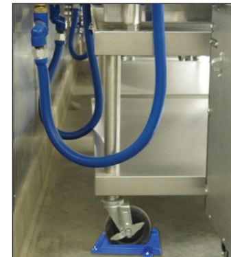
Open floor design allows appliance to sit firmly on the floor to ensure even cooking.

Safety-Set ensures that the appliance is situated beneath the fire suppression or ventilation systems.