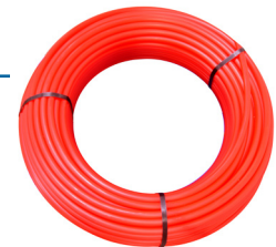
Pictured: HyperPure™ Coils