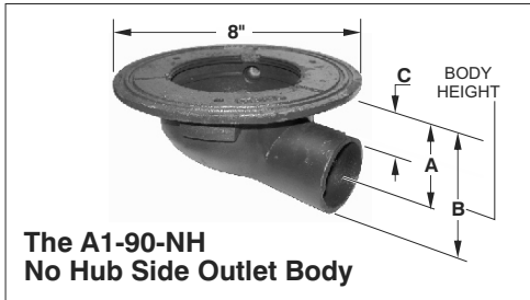
The A1-90-NH No Hub Side Outlet Body