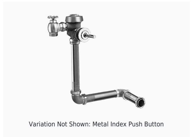
Variation Not Shown: Metal Index Push Button