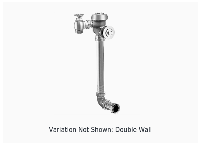
Variation Not Shown: Double Wall