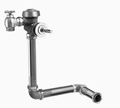
Variation Not Shown: 1" Straight Control Stop