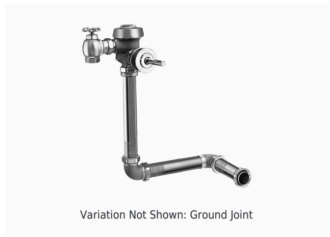
Variation Not Shown: Ground Joint