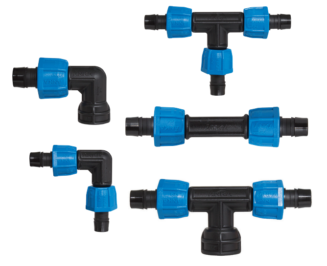
BLUE NUT FOR IDENTIFICATION